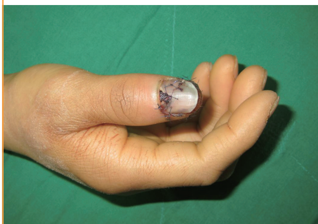
Fig. 6. 99m Tc-MDP 3-phase bone scan image

Skin necrosis on the right thumb was observed 3 days after the dog bite injury.