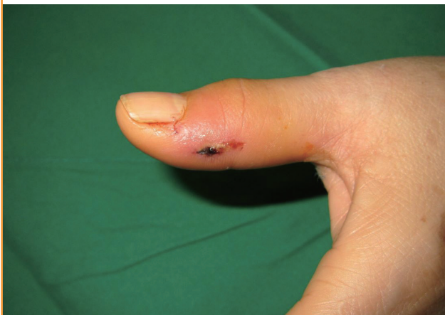
Fig. 2. 99m Tc-MDP 3-phase bone scan image

A simple laceration wound with mild tenderness on the distal phalanx of left thumb.