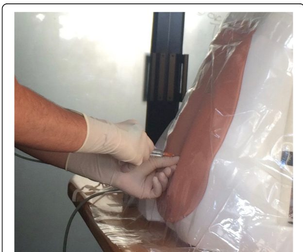
Fig. 1 ICSAD sensors attached on the back of the participant's hands

The ICSAD sensors were attached firmly on the back of the operator's hands, under the gloves (Fig. 1). This