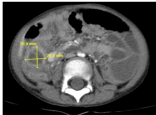
Figure 1 CT scan showing acute appendicitis with abscess formation.

The images shown demonstrate how large intra-abdominal processes can hide in the patient with neutropaenia. Due to the neutropaenia and lack of inflammatory immune responses, typical peritoneal signs were absent. His benign abdominal examination and continued oral intake were not suggestive of an intra-abdominal process at either time point, and