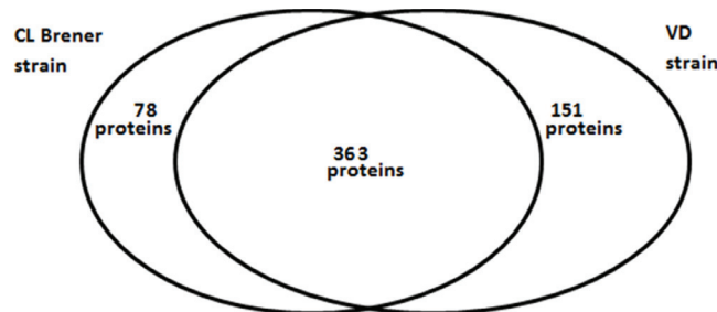
Fig 1. Overlap between secretomes of two different T. cruzi strains DTU Tc VI. A total of 591 proteins of T. cruzi were identified. We note that 78 proteins are specific to the CL Brener strain whereas 151 proteins are specific to VD strain. However, 363 proteins are common to both strains.

https://doi.org/10.1371/journal.pone.0185504.g001