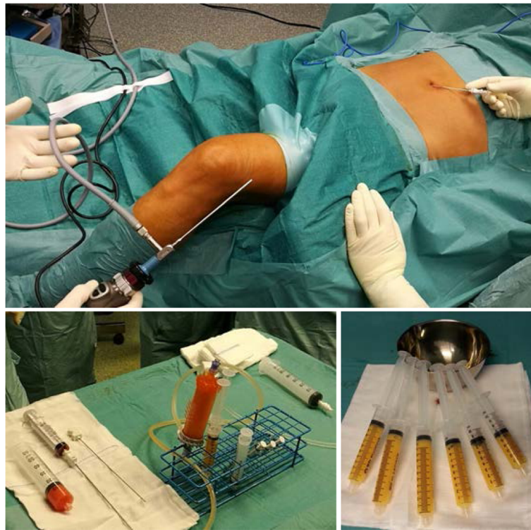
Fig. 1 Lipogems® system. Top) surgical setting. Bottom left) device. Bottom right) final product

adverse events, such as fever, infections, and excessive swelling of the knee.