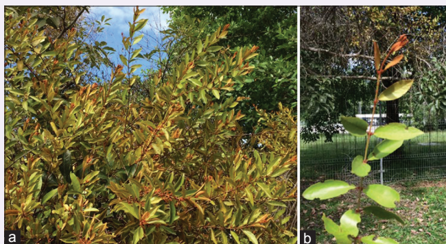
Figure 1: (a) Luscious bush of Scurrula ferruginea on a tree alongside the road in Brunei Darussalam. (b) A stalk of Scurrula ferruginea with the brown flower

D. curvata = Dendrophthoe curvata , M. cochinchinensis = Macrosolen cochinchinensis , S. ferruginea = Scurrula ferruginea , A. auriculiformis = Acacia auriculiformis , A. inermis = Andira inermis , M. indica = Mangifera indica , V. pinnata = Vitex pinnata , A. heterophyllus = Artocarpus heterophyllus , E. rubiginosum = Erioglossum rubiginosum , M. zapota = Manilkara zapota , T. calamansanai = Terminalia calamansanai , T. pallida = Tabebuia pallida , L. speciosa = Lagerstroemia speciosa