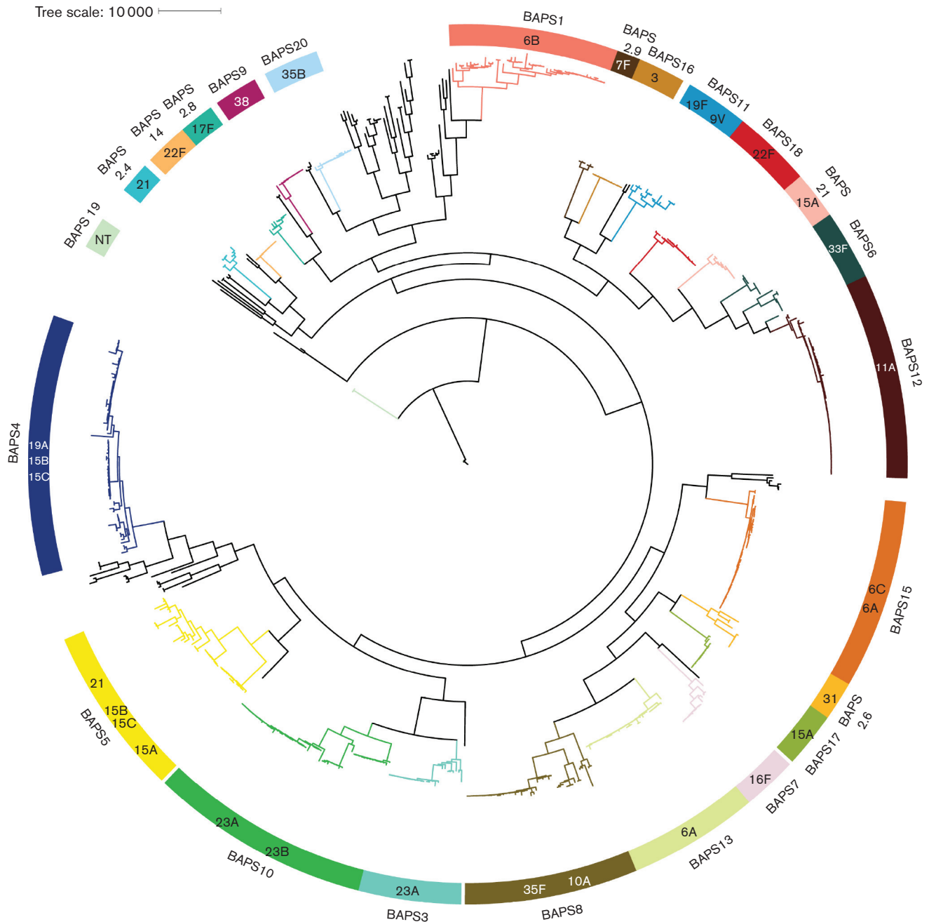
Fig. 1. Population structure of the pneumococcal collection, coloured blocks represent each BAPS lineage or sub-lineage of the bin with the corresponding branch coloured accordingly. BAPS lineage blocks are labelled internally with the predominant serotype/s ( n > 2 ) for the lineage with external labels denoting which BAPS lineage the block refers to.