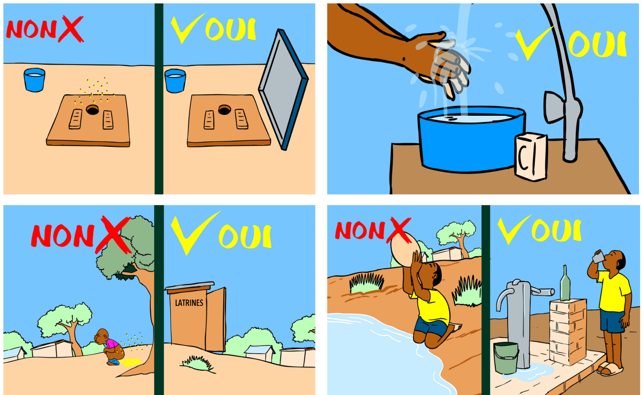
Fig 5. Extracts from the animated cartoon “Koko et les lunettes magiques”. The images show the final part of the animated cartoon where key messages are reinforced. Images of this last section are shown in 2D.

https://doi.org/10.1371/journal.pntd.0005839.g005