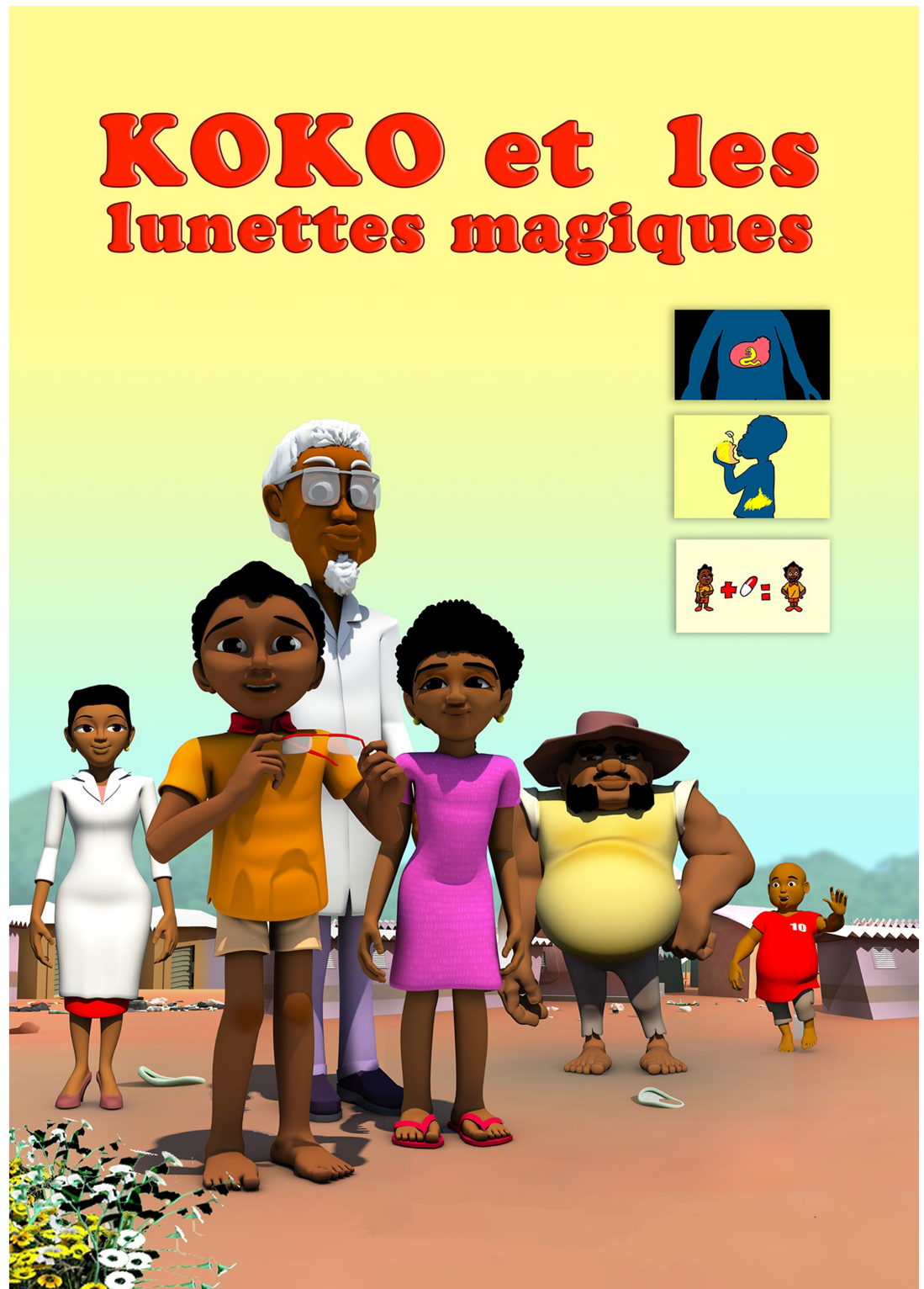
Fig 3. Poster “Koko et les lunettes magiques”.

https://doi.org/10.1371/journal.pntd.0005839.g003