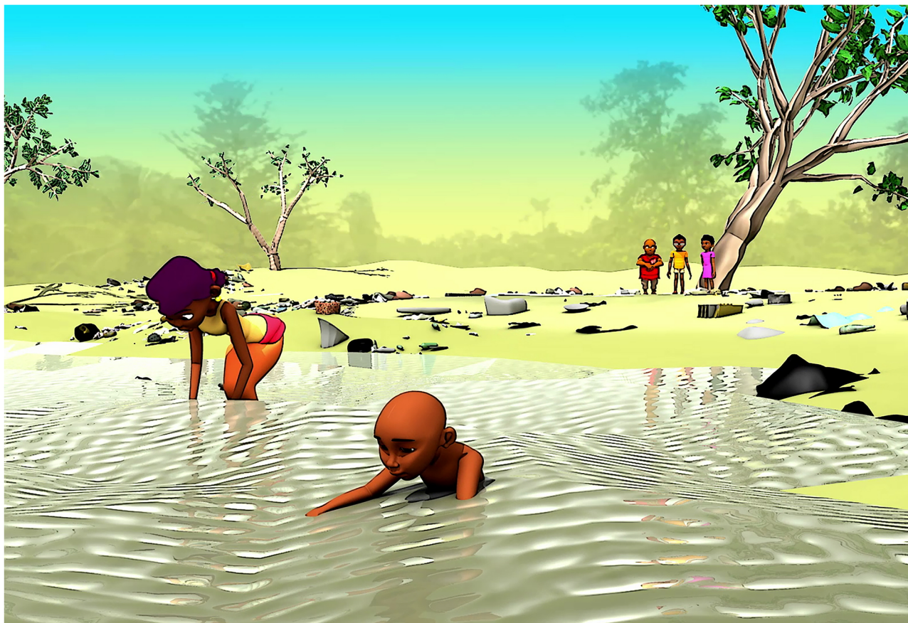
Fig 4. Extract from the animated cartoon “Koko et les lunettes magiques”. The 3D image shows Koko and his friends observing risk behavior of community members.

https://doi.org/10.1371/journal.pntd.0005839.g004