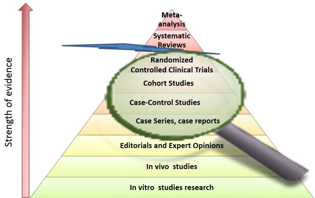
FIGURE 1: Revised pyramid for study designs and their place in evidence-based medicine