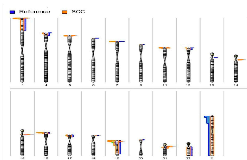
Figure 1. Karyogram view of detected amplified and deleted regions across autosomes. Amplifications are shown at right side of the chromosomes, and deletions are shown at the left side of the chromosomes. The length of the horizontal bar corresponds to the number of samples observed at the respective cytobands. Most of the amplifications were found in cases at the short arms of chromosomes 1, 5, 8, 16, 19 and 20, as well as the centromeres of chromosomes 14, 15 and 21. Most of the deletions in the cases were mainly observed at the short arms of chromosomes 1, 4, 5, 7, 11, 12, 16, 17 and 19, as well as the centromere of chromosome 19. We observed a statistically-significant difference of CNA burden between case and reference groups (Table 2) for different sizes of CNAs (>100 kb, 10–100 kb and 1–10 kb). For example, statistically-significant differences of >100 kb, 10–100 kb and 1–10 kb deletions were observed between reference (6.7%, 2.5%, 0.8%), pre-cancer (92.5%, 81.5%, 87.7%) and cancer (89.0%, 76.7%, 86.6%) groups, respectively (Table 2).

We processed genotype and intensity data for all 2.5 million probes of the Illumina HumanOmni2.5-8 BeadChip Kit for the 14 cases and 125 reference subjects. A number of CNAs (deletions or losses) was present in many chromosomal regions (Figure 1). A total of 2220 CNAs >1000 bp was identified, including 725 (32.7%) amplifications (gains) and 1495 (67.3%) deletions (losses) mainly on the 22 autosomal chromosomes.