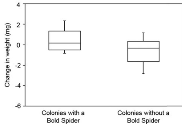
Figure 2. Stegodyphus dumicola colonies that contained a single bold spider, which gained more weight than colonies composed entirely of shy spiders. The center line of each box represents the median; the upper and lower margins of the box represents the 3rd and 1st quartiles respectively, and the whiskers represent the 10th and 90th percentile.

We found that colonies containing 1 bold spider gained on average 1.37 \pm 0.09 SE (standard error) mg more than shy colonies (Figure 2; GLMM: F_{1, 37.65} = 5.65 , P = 0.01 ). For colonies with a bold individual the latency to attack was 39.70 \pm 9.86 s and number of attackers 1.84 \pm 0.12 and for all-shy colonies the latency to attack was 44.16 \pm 7.36 s and number of attackers 1.59 \pm 0.08 . However, colonies with and without a bold individual did not differ significantly in either their latency to attack (GLMM: F_{1, 39.39} = 0.0227 , P = 0.71 ) or number of attackers (GLMM: F_{1, 0} = 2.92 , P =