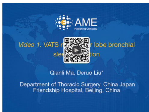
Figure 1 VATS right upper lobe bronchial sleeve resection [Reprinted with permission (18)].