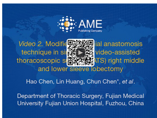
Figure 2 Modified bronchial anastomosis technique in singleport video-assisted thoracoscopic surgery (VATS) right middle and lower sleeve lobectomy [Reprinted with permission (20)].