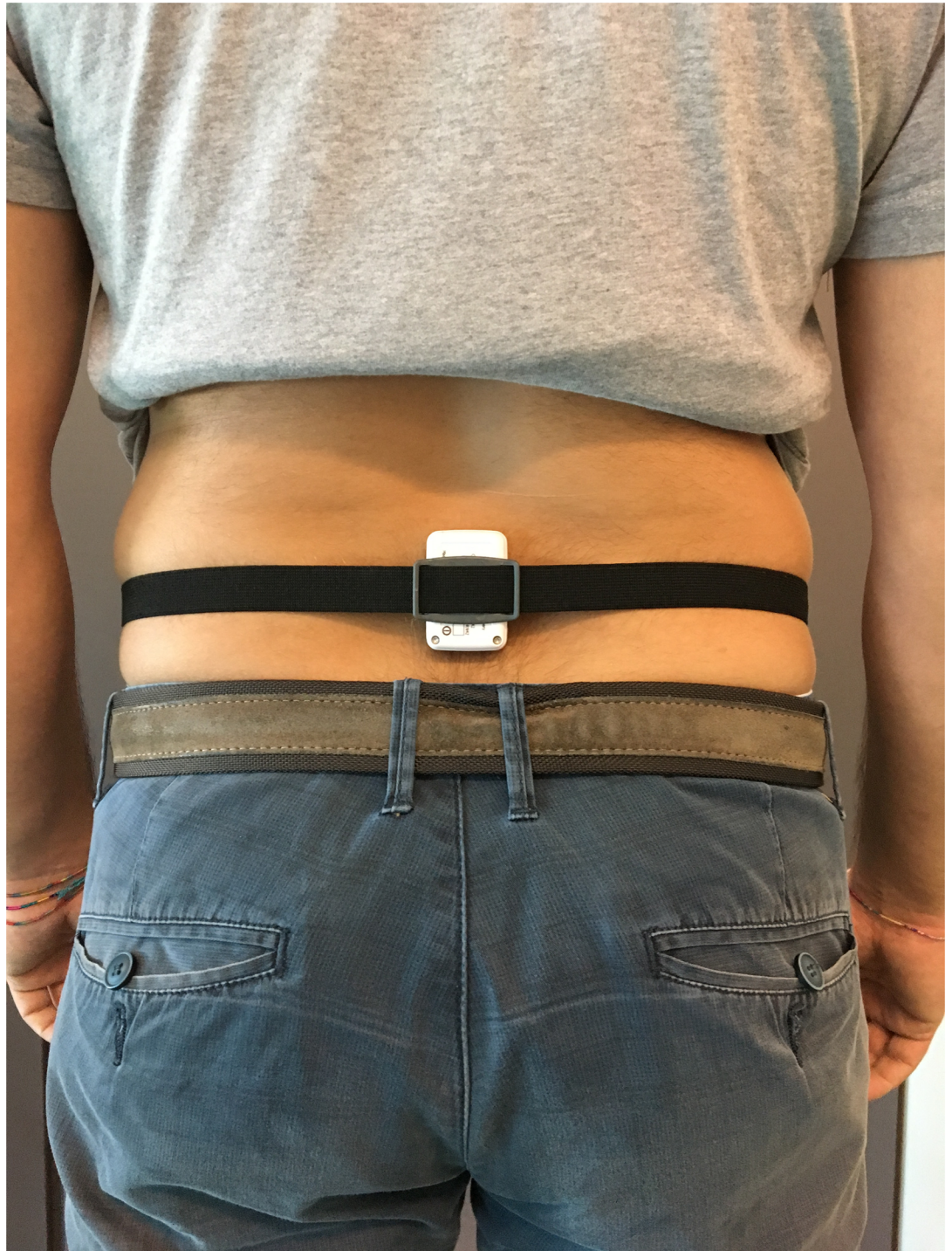
Fig 1. Placement of the inertial sensor on L3.

https://doi.org/10.1371/journal.pone.0185825.g001