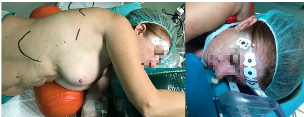
Figure 7 Oropharyngeal cannula in the setting-up of a nonintubated uniportal VATS right-upper lobectomy.