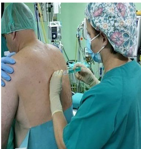
Figure 4 Epidural catheter placement during thoracic surgery

30 and 50. Urinary catheter is placed in some cases, although we have operated many patients through a tubeless approach;