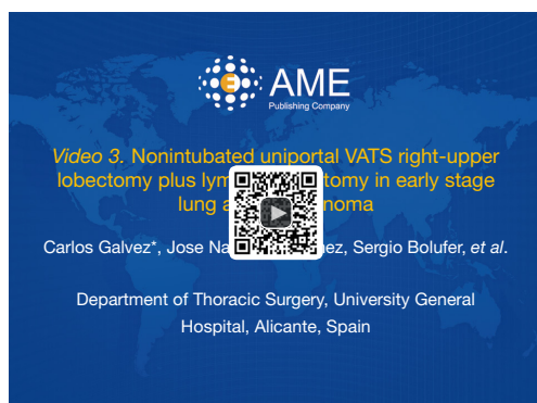
Figure 9 Nonintubated uniportal VATS right-upper lobectomy plus lymphadenectomy in early stage lung adenocarcinoma (30). Available online: http://www.asvide.com/articles/1681

the procedure, as with the standard intubated patients. Physiology of surgical pneumothorax endangers this purpose due mainly to the mediastinal movement. When initiating the procedure after pleural incision, patient feels discomfort because surgical pneumothorax has been developed, so an increase in the respiratory rate and the depth of breathing begins. Performing the intercostal and vagal block (for pain relief and cough abolition) and waiting 1–2 min allows the patient to get used to these changes and normalize the respiratory rate (preferably between 12–20 bpm) and what is most important, to normalize the depth of breathing so the mediastinal movement minimizes. Then, operating under these conditions is almost indistinguishable from intubated patients.