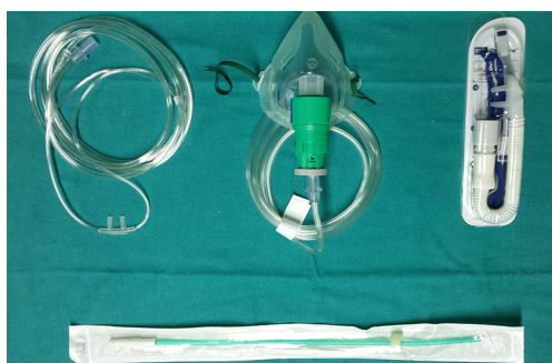
Figure 6 Oxygenation devices used during nonintubated procedures: from left to right on the top, nasal prongs, facial mask, high-flow oxygen nasal prongs. At the bottom, oropharyngeal cannula.

Available online: http://www.asvide.com/articles/1679