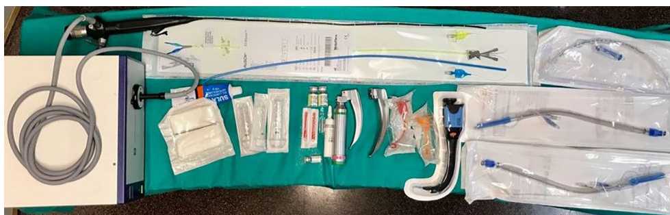
Figure 11 Emergency Table elements: the picture shows the required elements for management of a crisis during nonintubated uniportal VATS anatomical resections, as detailed in Table 3 .

All the members of the team know what to do in every moment. We have had several briefing meetings before we start the procedure.