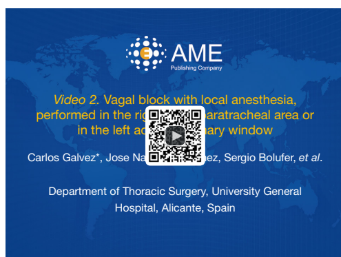
Figure 8 Vagal block with local anesthesia, performed in the right lower paratracheal area or in the left aortopulmonary window (29). Bupivacaine 0.5% is commonly used due to the duration of the effect. Available online: http://www.asvide.com/articles/1680