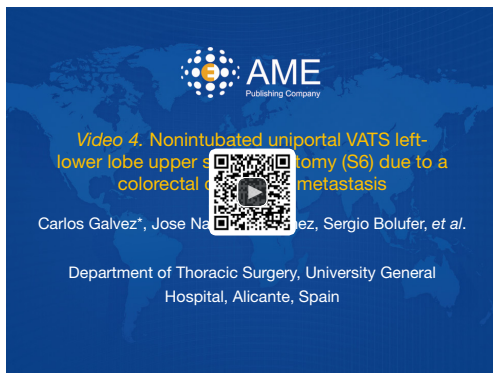
Figure 10 Nonintubated uniportal VATS left-lower lobe upper segmentectomy (S6) due to a colorectal carcinoma metastasis (31). Available online: http://www.asvide.com/articles/1682