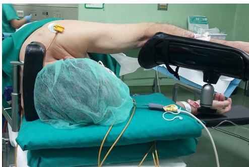
Figure 1 Position of the patient during lateral decubitus intubation: neutral position, using a couple of surgical pillows and an occipital support to prevent the head going backwards during the laryngoscopy.