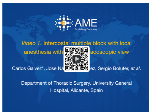
Figure 5 Intercostal multiple block with local anesthesia with direct thoracoscopic view (27).

Available online: http://www.asvide.com/articles/1679