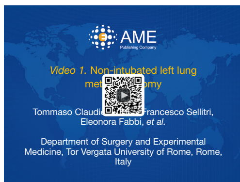
Figure 1 Non-intubated left lung metastasectomy (13). Available online: http://www.asvide.com/articles/1678