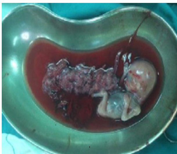
Fig.3: Fetus with placenta.