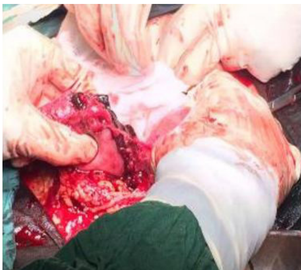
Fig.2: A 4-cm ruptured rudimentary horn with placenta partially protruding from it.