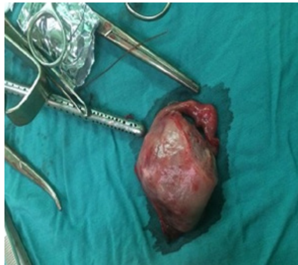
Fig.4: Excised rudimentary horn.