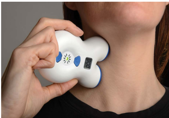
Figure 1 Positioning of the non-invasive vagus nerve stimulation device.

The nVNS device delivered a low-voltage electrical signal consisting of a 5 kHz sine wave series occurring for 1 ms and repeated every 40 ms (25 Hz). Stimulation was administered via two stainless steel contact surfaces that were coated with conductive gel before each treatment, and the device was positioned in parallel with the carotid pulse in the neck (figure 1). A single stimulation of nVNS was programmed as