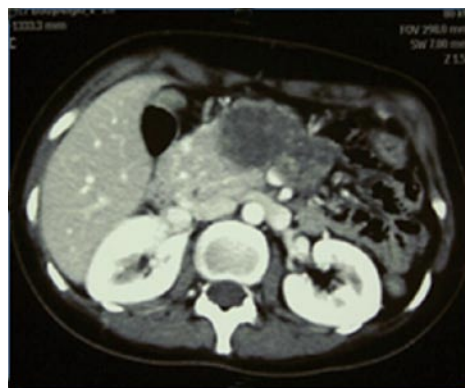
Figure 1 Preoperative computed tomography view of a 26-year-old female patient with a diagnosis of pseudo-papillary tumors. The figure shows that the lesion occupied the body and neck region with necrosis of the tail on preoperative computed tomography imaging. Normal pancreatic tissue is observed in the ventral pancreas region.

The surgical procedures were performed by one group of experienced surgeons in our department of pancreatic surgery. We performed a complete Kocher