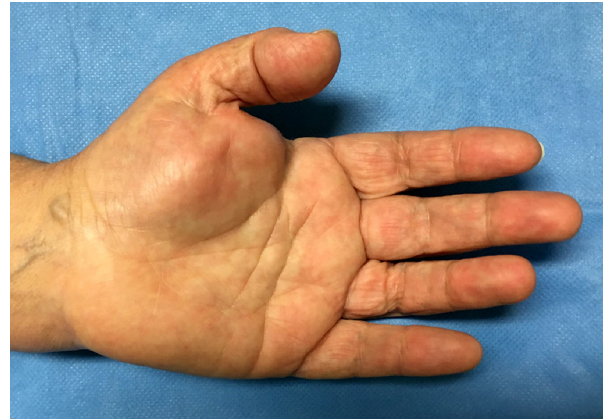
Fig. 2 – Swelling of the thenar eminence.

An electromyography of the wrist was done, which identified aspects consistent with marked left median nerve lesion.