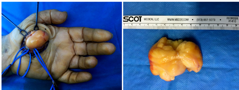
Fig. 3 – Intraoperative photo of palmar lipoma.