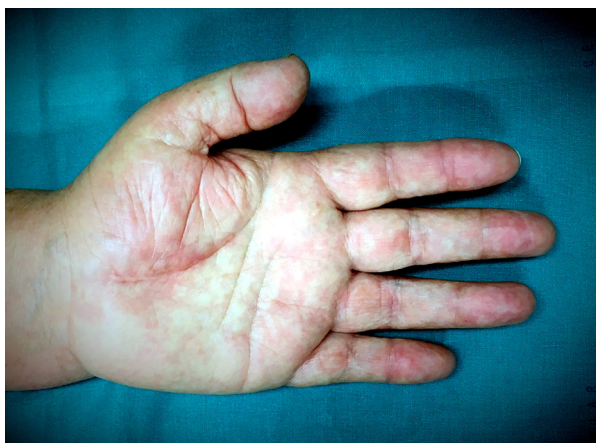
Fig. 5 – Postoperative photo after five months.

Hand lipoma has a higher incidence in individuals between 50 and 60 years and is generally asymptomatic, revealing itself as a mobile and painless mass of progressive growth. Sometimes, when it becomes massive or in certain locations, it can cause symptoms resulting from nervous compression. 1-4,6,8,9 Intramuscular or subfascial giant lipomas of the hand (>5 cm of diameter) can be the cause of carpal tunnel syndrome; there are few cases described in the literature. 6