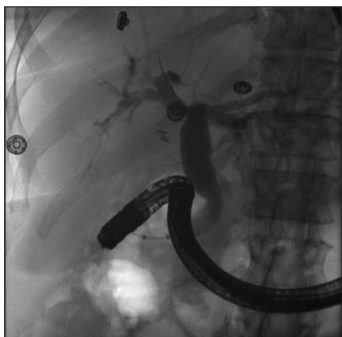
Fig. 2. ERCP image taken during stent removal indicating resolution of biliary obstruction.

were moderately dilated. A filling defect consistent with a stone was seen on the cholangiogram. There was also a low lying cystic duct and long cystic duct remnant (Fig. 1). The biliary tree was swept and a trans -papillary dilation was performed. Sludge and stone fragments were removed. It was unclear if the stone fragments were completely removed, therefore a 10Fr × 7 cm plastic stent was placed into the common bile duct.