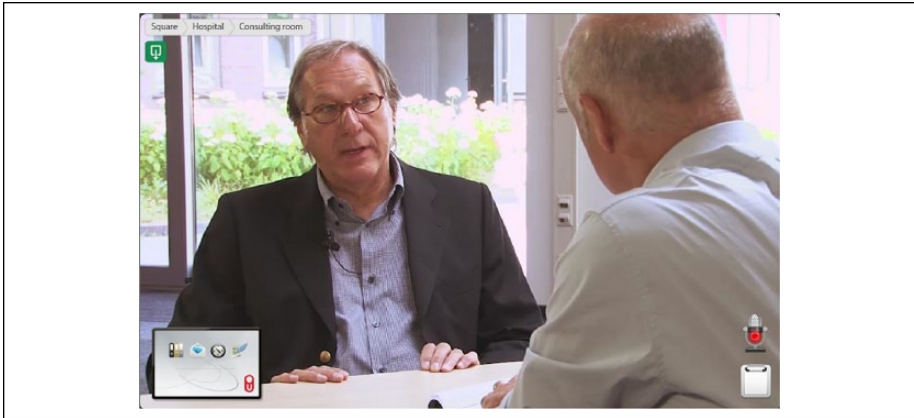
Figure 1. A patient being interviewed. At the bottom left, we see the tablet, and at the bottom right, we see the memo recorder and notepad.

feedback can incorporate mail attachments or the release of resources, such as worked-out examples or expert reports. The student gets navigation support through alerts, e.g., reminders for meetings or instructions for where to go next.