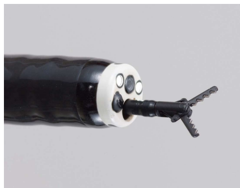
Figure 1 The distal tip of the Clutch Cutter (long type: Blade length of 5 mm).

Otsuka Y, Akahoshi K, Yasunaga K, Kubokawa M, Gibo J, Osada S, Tokumaru K, Miyamoto K, Sato T, Shiratsuchi Y, Oya M, Koga H, Ihara E, Nakamura K. Clinical outcomes of Clutch Cutter