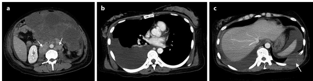
Fig. 1. Contrast-enhanced computed tomography. a An abdominal scan showing a 24-cm solid tumour in the upper left side of the uterus and enlargement of the para-aortic lymph nodes (arrows). b A chest scan showing a large amount of right-sided pleural effusion. c An abdominal scan showing a large amount of peritoneal effusion and a metastatic tumour at the 5th rib (arrow).