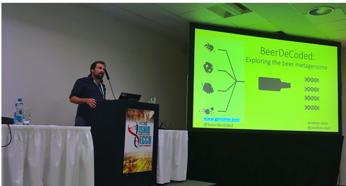
Figure 7. Jonathan Sobel of Hackuarium talking about BeerDeCoded at BOSC 2017 (photo by Bastian Greshake Tzovaras).