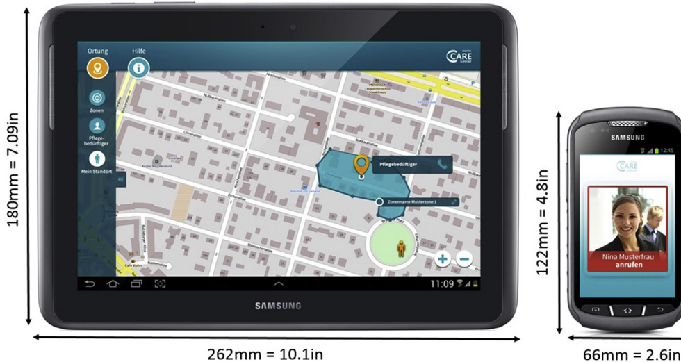
Fig. 1. Tablet PC for caregiver and smartphone for PwD, both with the installed prototype.