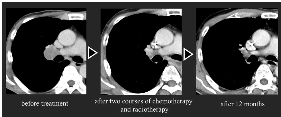
Figure 5. Two courses of chemotherapy and radiotherapy resulted in a complete response of the tumor. There has been no sign of recurrence for more than 12 months after the initial treatment.