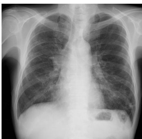
Figure 1. A chest radiograph taken at the patient's admission to our hospital showed swelling of the right hilum and scattered ground-glass opacity.

releasing peptide level (Table). Chest radiography revealed swelling of the right hilum and scattered ground-glass opacity, which suggested inflammatory changes after aspiration pneumonia due to vomiting (Fig. 1). Chest (Fig. 2) and abdominal CT scans (Fig. 3) showed findings similar to those of the previous CT scans obtained at the local hospital. Endobronchial ultrasound-guided transbronchial needle aspiration of the hilar mass revealed small cell carcinoma. 18 F-fluorodeoxyglucose positron emission tomography (FDG-PET) and cerebral magnetic resonance imaging revealed no metastatic lesions. From these observations, he was diagnosed with limited-stage SCLC, clinical T1b N1 M0 stage IIA. Furthermore, his functional ileus was diagnosed as CIPO because no organic disorder was detected on upper or lower gastrointestinal endoscopies or small bowel radiography. In addition, both CIPO and OH were diagnosed as PNS because anti-Hu antibody was detected in his serum sample and no underlying diseases, such as amyloidosis or diabetic neuropathy, which induce CIPO, were observed. Although he was not able to take meals, he suffered no gastrointestinal symptoms from being dependent on intravenous hypera-