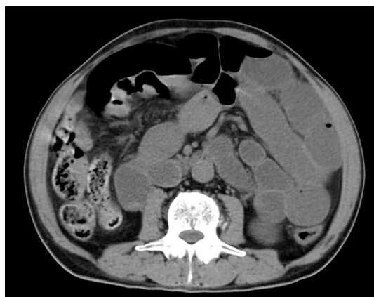
Figure 3. An abdominal CT scan on admission showed intestinal dilatation with air-fluid levels.

sical PNS comprises various neurological symptoms, including OH, that can occur as PNS (2).