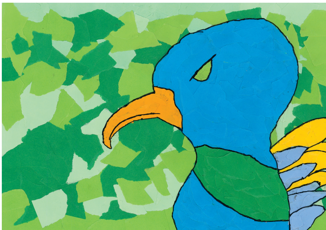
Eagle by Dulan Kumal Acharya (age 10) from Operation Art 2016