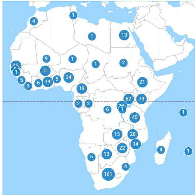
Figure 1. Map output from World RePORT which shows the number of research organizations by country in fiscal year 2015. See appendix for full list by country Map output from World RePORT showing the number of research organizations in each labeled country that received funding for genetics or genomics research in fiscal year 2015. A complete list of research organizations by country is provided in the appendix.