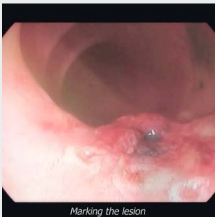
Video 1 Full-length video of endoscopic full-thickness resection in patient #4 performed with the Full-Thickness Resection Device (FTRD®) System.