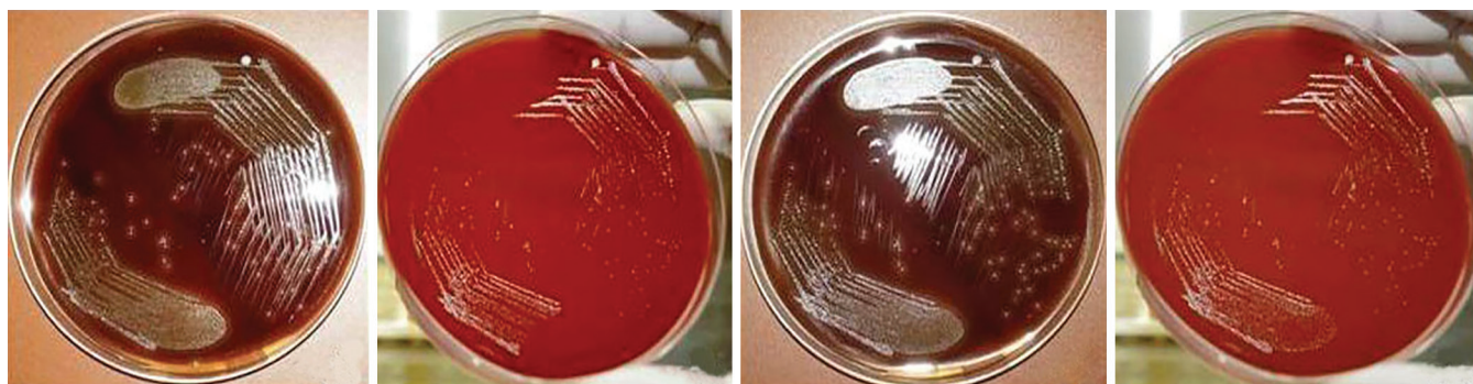
Fig. 1: S1 samples (CFU/mL) of different groups