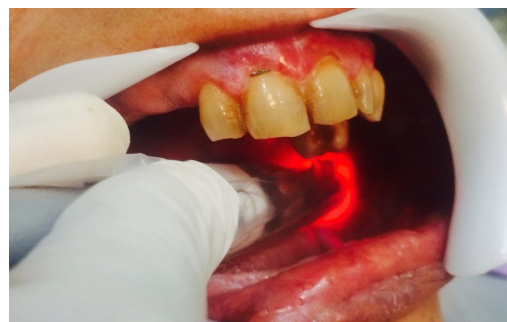
Figure 3. Applying 980 nm diode laser on the buccal mucosa lesion.

The visual analogue scale (VAS) was used to measure the