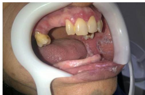
Figure 2. Wickham's Striae on Left Buccal Mucosa.

begin laser therapy. The patient was asked to stop taking drugs for three months so that the effect of laser therapy could be evaluated. Firstly the 980 nm diode laser (Wiser, Doctor Smile, Italy) was used for photobiomodulation (PBM), (0.3 W, 6 J, 20 seconds, continuous wavelength (CW) mode, energy density of 6 J/cm 2 ), after 4 sessions and with slight decrease of pain and soreness the setting changed to 0.2 W, 4 J, 20 seconds, CW, energy density of 4 J/cm 2 ; then the treatment continued up to 10 sessions (3 sessions in a week); as a result, the patient was satisfied and declared no pain and soreness, also, the saliva showed significant increase (Figure 3).