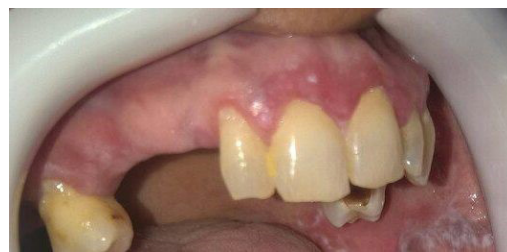
Figure 1. Mild Gingivitis Accompanied by Erosive Lesion on the Maxillary Gingiva.

The patient was prescribed Nystatin drops, chlorhexidine, and triamcinolone ointment. But after 2 months of treatment, no recovery was seen in signs and symptoms. After this period, the patient was referred to a private office to