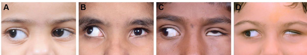
Figure 2 Clinical grading system for globe retraction and overshoots.

Figure 2 shows various grades of retraction and overshoot.