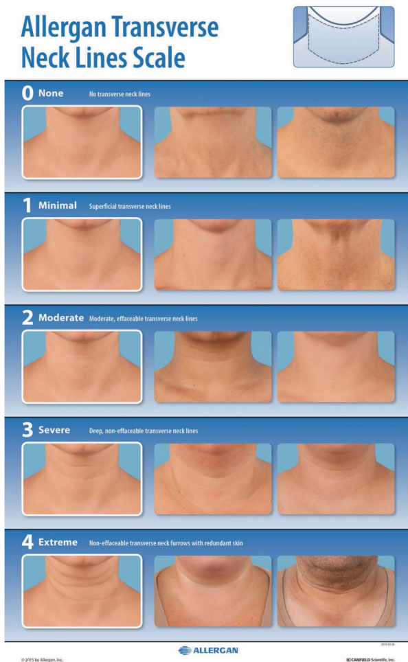
Figure 3. The Allergan Transverse Neck Lines Scale assigns a grade from none (0) to extreme (4) that describes the presence and depth of transverse lines within the area of the neck demarcated in the diagram in the upper right corner.

session using 4 example subjects. Raters were instructed to rate only horizontal neck lines, to disregard vertical lines (e.g., platysmal bands on neck), to select a grade based on the most severe line present (with 1 line being sufficient to determine grade), and to assess effaceable versus non-effaceable lines visually and not through attempts to manually efface lines (Figure 3).