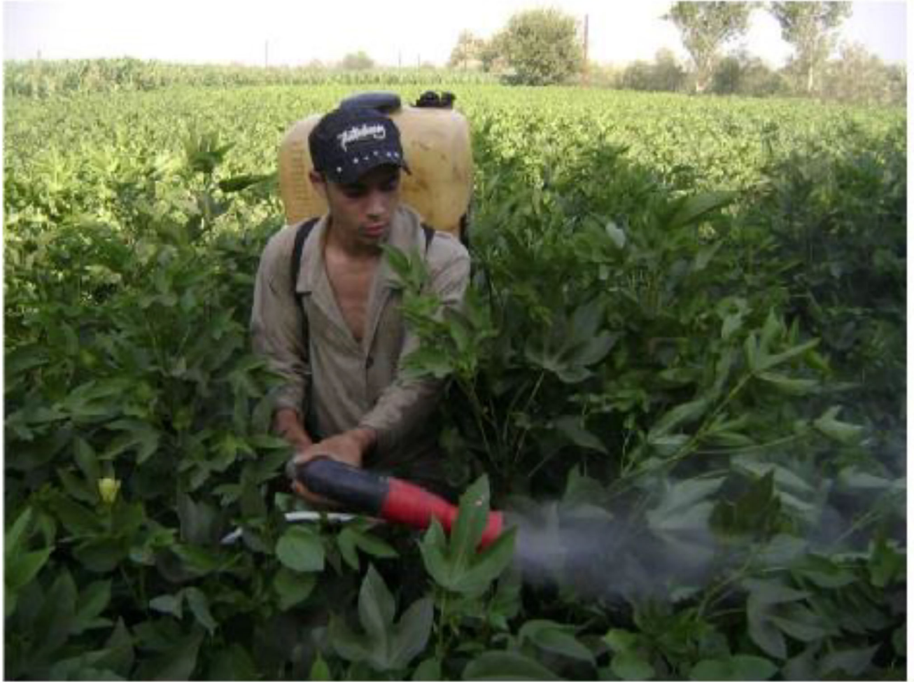
Figure 2. Image of study participant spraying CPF, note absence of PPE and saturation of clothing