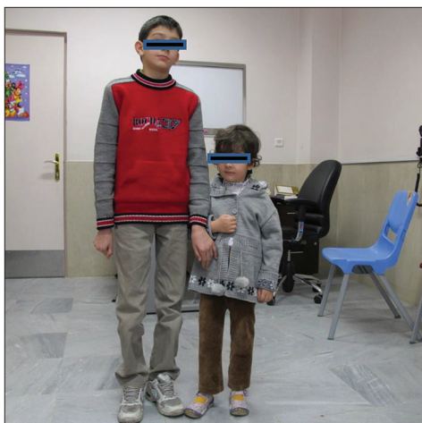
Figure 1: The case and her brother

Anticoagulation therapy (heparin followed by warfarin) was started along with antiepileptic medications. Furthermore, the patient was treated with folic acid, vitamin B6, vitamin B12, and vitamin C. Later, betaine was added to her treatment.