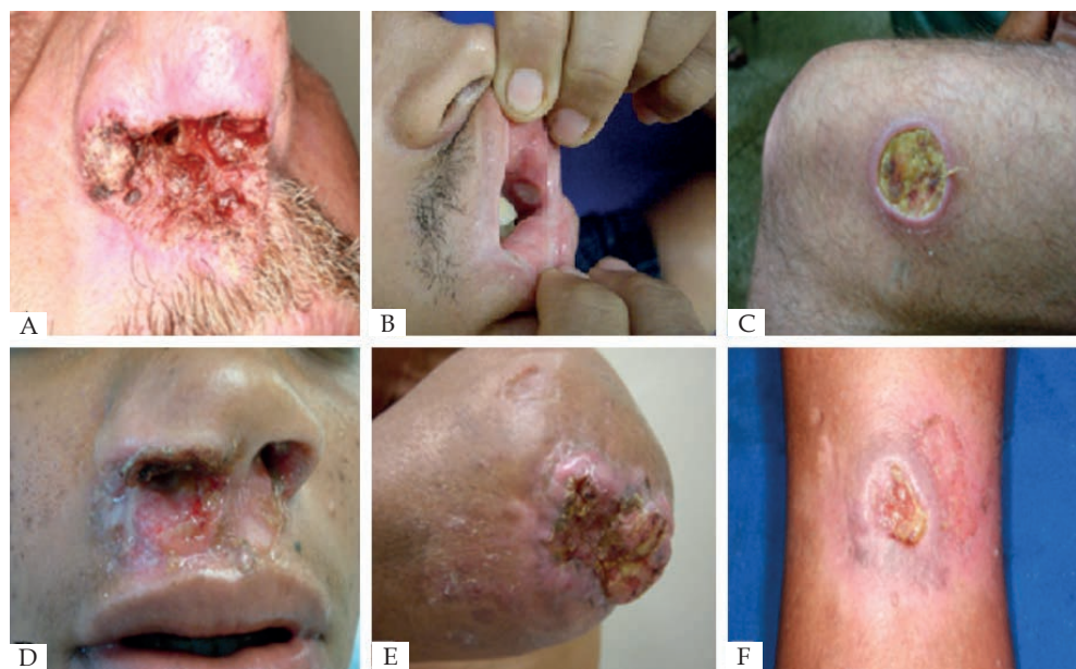
FIGURE 1: A. Nasal mucous and perinasal ulcerated lesion: Paracoccidiodomycosis; B. Oral lesion: Behçet's disease; C. Well-defined ulcerated lesion in the knee: ulcerated (echtymatous) erythema nodosum leprosum; D. Nasal mucous and perinasal ulcerated lesion: Drug addiction (Cocaine user); E. Ulcerated lesion on the elbow: Squamous cell carcinoma; F. Well-defined ulcerated lesion in the: hypertensive ulcer