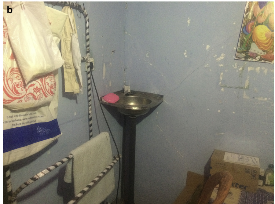
Figure 2. (a) Home conditions of a patient on continuous ambulatory peritoneal dialysis in Girandurukotte. Ventilation has been installed. (b) Stand-alone sinks have been installed.

As the training process continues, the local clinic aims to take over the "routine" care of patients, with supervision from nephrologists at Kandy Hospital at the start of therapy and in case of major complications.