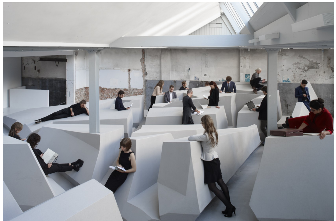
Fig 1. The End of Sitting. The people in this photo did not participate in the study.

To further develop such landscapes it is important to find out the workspaces in the landscape that invite postures that elevate energy expenditure, offer temporary comfort, and do not reduce productivity. To this end, we selected four workspaces that were frequently used by participants when working in The End of Sitting [20] and compared them with sitting or standing behind a desk. It was expected that working in The End of Sitting workspaces produces a rise in energy expenditure compared to sitting behind a desk. A purpose of the design