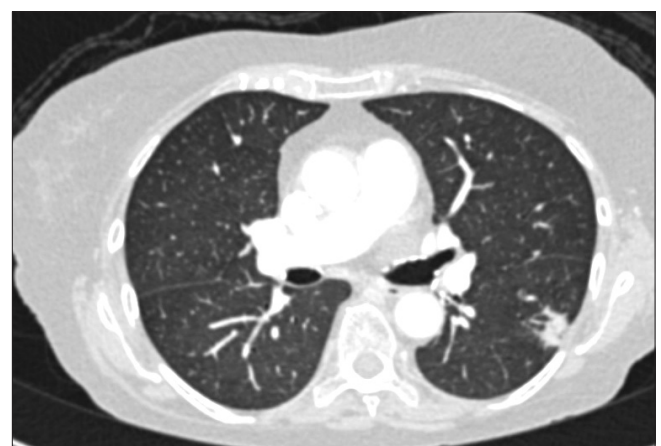
Fig. 1. Cross-sectional view of the CT image showing pneumonia of the right lung and multiple alveolar consolidations, consistent with the diagnosis of Pneumocystis jiroveci pneumonia (case 1).

A 68-year-old man with a history of CD of the terminal ileum for 21 years. He had undergone 4 previous surgeries for CD of the terminal ileum. His condition recurred after the operation (abdominal pain, diarrhea, and weight loss), which was confirmed endoscopically (Fig. 2). He was initially commenced on azathioprine 50 mg a day and prednisolone 40 mg a day; however, he failed to achieve clinical remission after 4 weeks of therapy. IFX was added owing to a suboptimal response and the history of multiple surgeries. Pre-therapy screening for TB (CXR and T-SPOT. TB test) was negative, and the patient received 3 infusions of IFX. His CS was tapered after the first infusion of IFX by 5 mg/wk, as per our general protocol. He responded very well to the treatment and achieved clinical remission. However, 3 days after his third infusion, he presented with pyrexia of unknown ori-