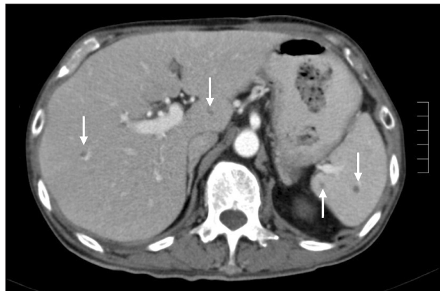
Fig. 3. CT image of the abdomen showing disseminated micro-abscesses of the liver and spleen (arrows) (case 2).

A 61-year-old woman with Crohn's colitis for 6 years. She had chronic active disease despite being on maintenance therapy with azathioprine and sulfasalazine, requiring multiple courses of prednisolone. She subsequently developed a perianal fistula as well as a colovesical fistula, with recur-