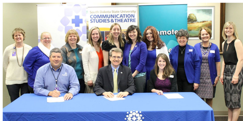
Fig. 5 | Breastfeeding-friendly business initiative pledge signing event

Community coalition activity —The prioritized action of “establishing a permanent group to provide education