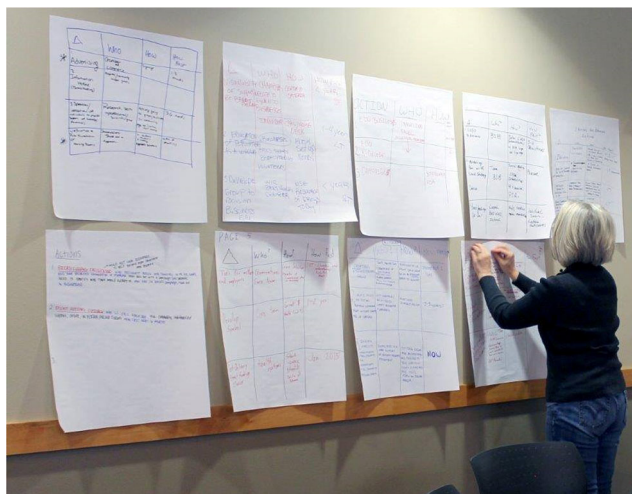
Fig. 3 | Prioritized approaches from each table discussion at the public deliberation event

uncertainty regarding who would be responsible for creating and delivering content.