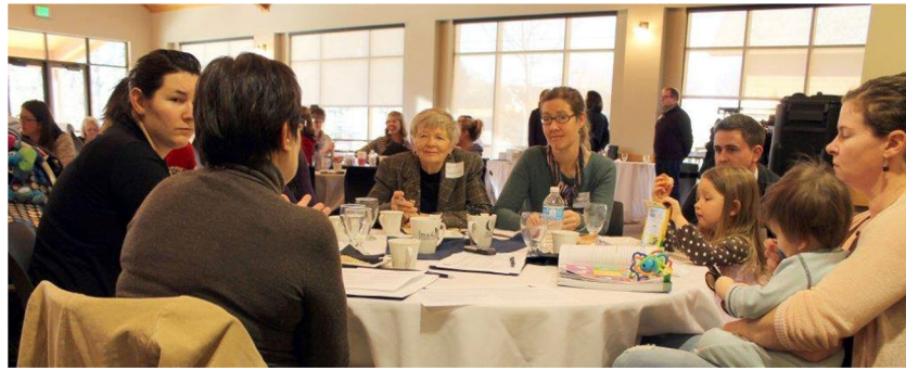
Fig. 2 | Community members discuss breastfeeding at the public deliberation event

arge poster boards during the event; at the conclusion of the event, facilitators and notetakers completed brief questionnaires to summarize themes in the conversations. These data were used to generate the final event report, on which the event outcome results section is based. After the event, field notes were used to record changes in breastfeeding support in our community.