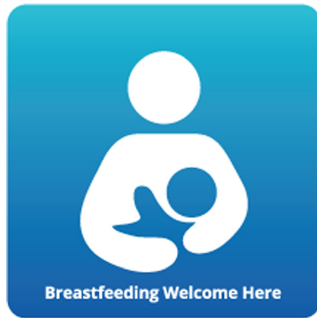
Fig. 4 | Breastfeeding-friendly business initiative window cling

keen to share information via “word-of-mouth” or simply talking more about this issue with others in the community. For a taboo topic like breastfeeding, commitments to increasing communication about the issue are an extremely important outcome that can lead to the type of culture change that participants discussed during the public deliberation. Many participants also expressed a desire to provide direct support to breastfeeding mothers, whether as a spouse, a co-worker, a friend, or simply a community member who notices and encourages a breastfeeding mother. Public deliberation is a form of dissemination that sparks further dissemination through informal, interpersonal channels that are essential to the long-term success of community-based health initiatives [27].