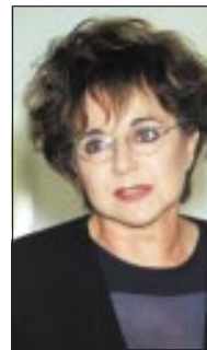
Dr Miriam Stoppard