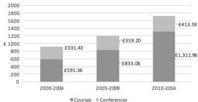
Figure 3 Mean expense per year on courses and conferences that trainees have not been reimbursed. Trainees grouped into 5-year generations by year of graduation. Expense on courses has increased significantly comparing the most recent generation (graduation between 2010 and 2014) with the older generation (graduation between 2000 and 2004) ( p<0.01 ). Expense on conferences has not significantly increased ( p=0.28 ). UK medical school graduates only.

By the end of training, a surgical trainee in the UK can expect to have spent on average £9105 on courses, £5411 on conferences and £4185 on exams (£18 701) that they have not been reimbursed through any source. Expense per year on conferences has marginally increased from