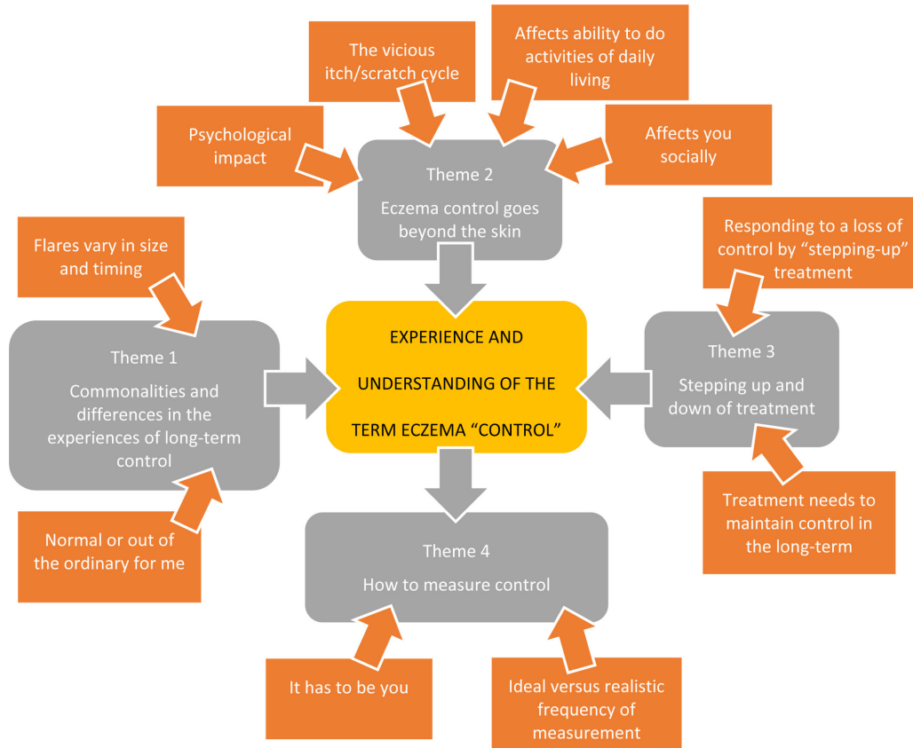
Figure 2 Mapping of the thematic framework.

If I catch a minor flare quickly enough I can sometimes control the irritation before it get completely out of control to what I call a meltdown. (Participant 5, group 1, female, aged 20 years)