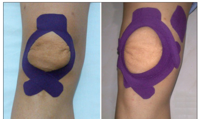
Figure 1: Knee taping method in the current study. Accordingly three tape straps were used: The first Y-shaped tape was placed from top to bottom of the knee, the second Y-shaped tape was placed from the lateral to the medial of the knee, and the third I-shaped tape was placed over the vastus medialis obliquus