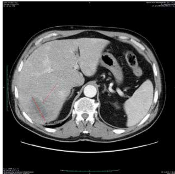
Fig. 2. CT scan after the last cycle of TACE showing decrease in diameter of the target lesion (60 mm) and a decrease in attenuation – 39 HU (arrow)