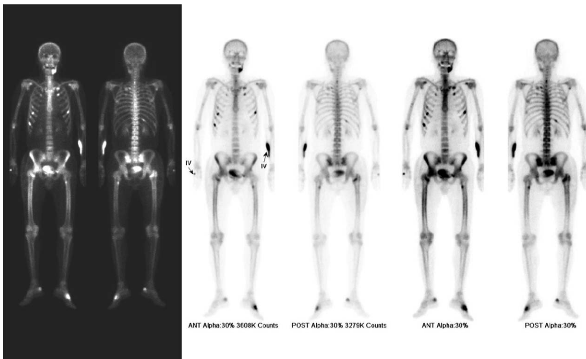
Figure 3. Osteomalacia was observed in the bilateral femoral lesser trochanter, left superior ramus, bilateral sacrum ala, bilateral ribs on bone scan, and SPECT. SPECT = single-photon emission computed tomography.

TDF treatment is known to increase bone turnover but decrease bone mineral density. [10] A study by Gallant et al [10] have reported that TDF is significantly associated with bone loss compared to other antiretroviral agents. However, bone loss is not a progressive phenomenon. It is so small that it is not obvious