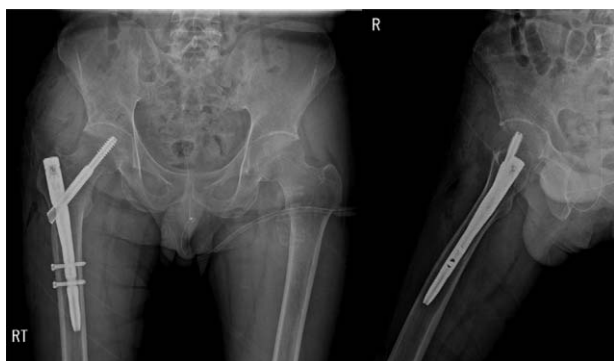
Figure 2. In order to prevent further fractures of the right lesser trochanter, internal fixation was performed using compression hip nail.

at 1.32 mg/dL. However, his phosphorus and serum calcium levels were maintained within normal range (at 2.6 and 9.5 mg/dL, respectively). Pain in the right thigh region was improved from visual analogue pain score (VAS) 7 before surgery to VAS 2 after surgery.