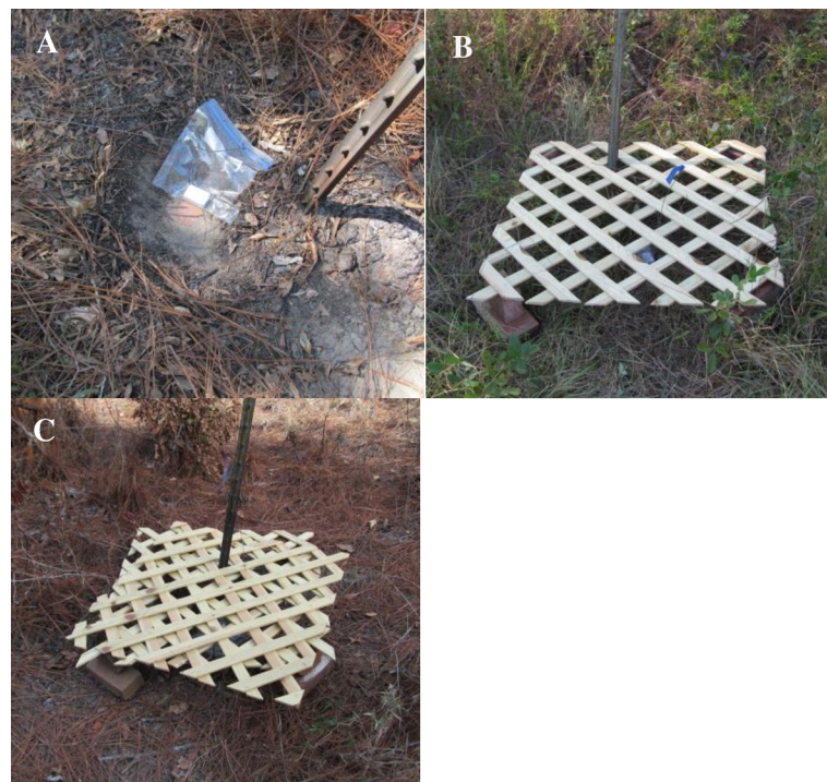
Fig 1. Set-up of trials to determine effect of cover on accuracy of i-gotU GT-120 GPS loggers. Cover treatments included A) no cover, B) logger centered under a single layer of wooden lattice, and C) logger centered under two layers of lattice, offset. The GPS loggers were set at ground control points (GCPs) with accuracy known to \leq 30 cm in Baker County, Georgia, USA in October 2015.

https://doi.org/10.1371/journal.pone.0189020.g001