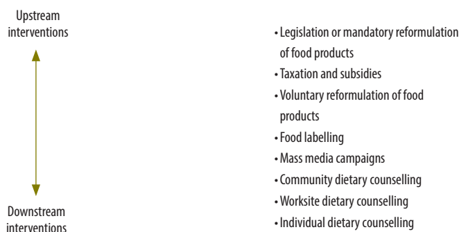
Fig. 1. Interventions classified on the upstream–downstream continuum in the systematic review of dietary trans-fatty acid reduction policies

Note: Based on the McLaren continuum of interventions. 8