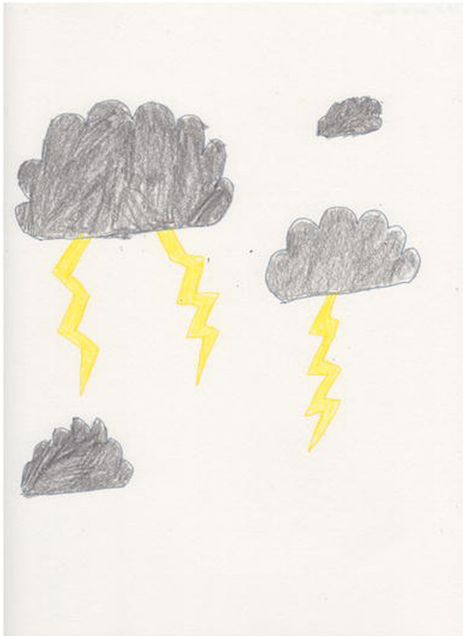
Figure 6. Sick day: stormy weather