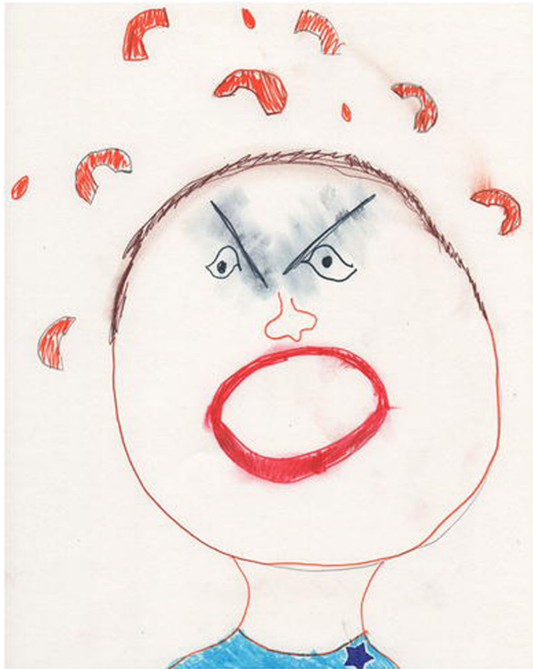
Figure 5. Sick day: anger and frustration