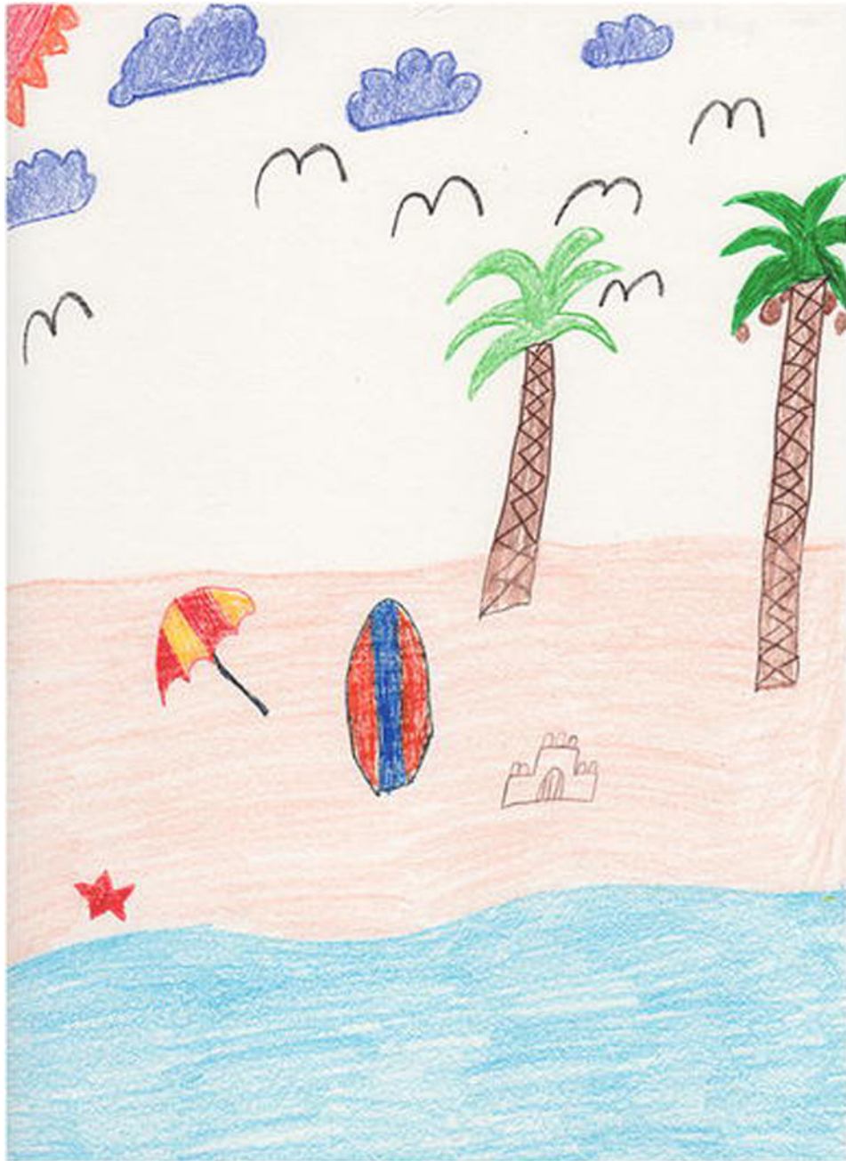
Figure 3. Good day: memorable vacation location