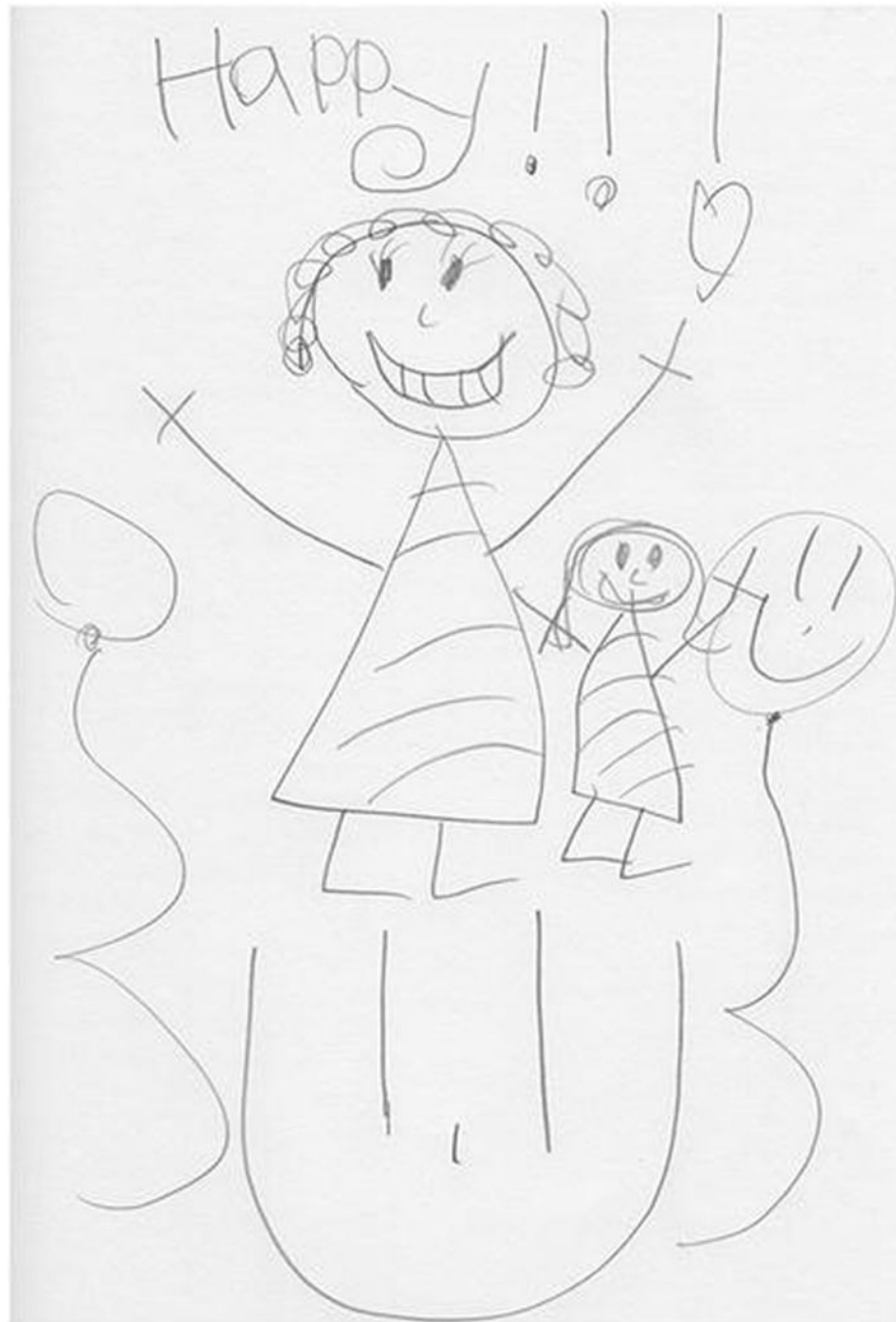
Figure 1. Good day: playing together with sibling