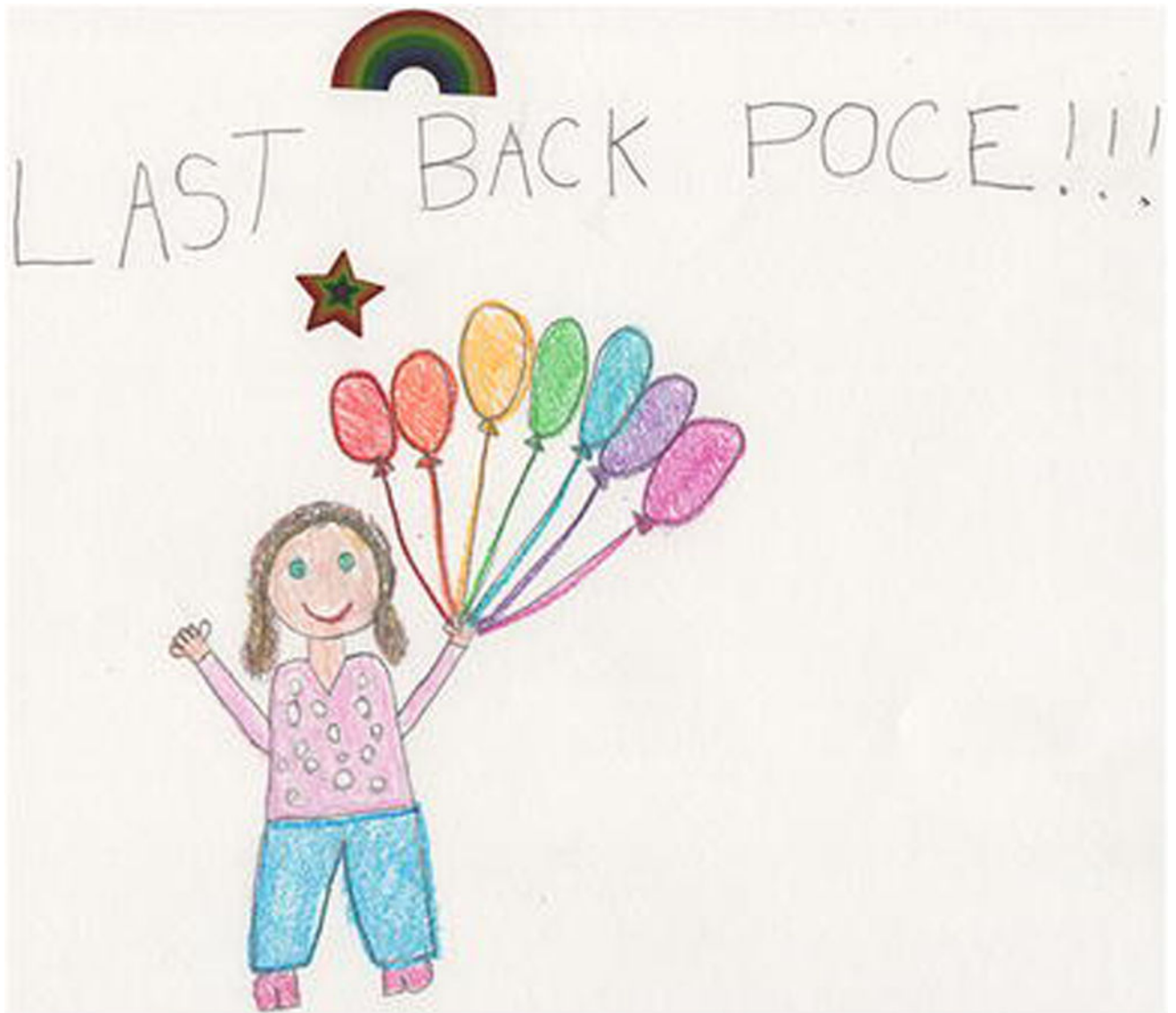
Figure 2. Good day: celebrating treatment milestones