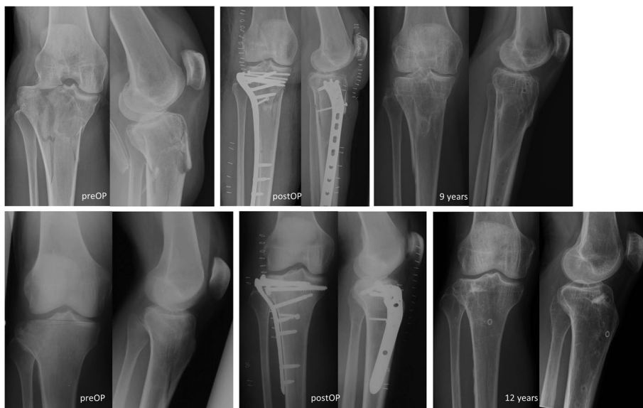
Fig. 1 Radiographs showing preoperative, postoperative, and long-term condition after tibial head fracture. Patient 1 nine years after bicondylar tibial head dislocation fracture. Patient 2 sustained a lateral depression type tibial head fracture 12 years ago

In this prospective study, we demonstrate that the FJS is a valid and reliable PROM-tool in patients after surgical